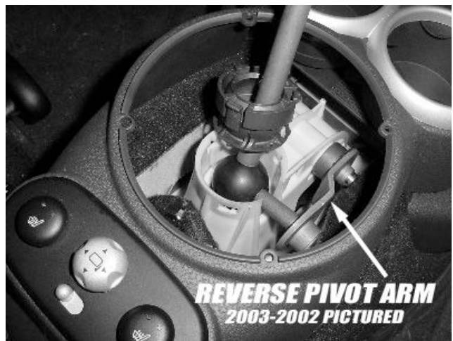
2002-2003 shown, 2004+ has black plastic body, and pivot arm.