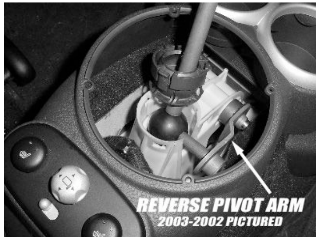
2002-2003 shown, 2004+ has black plastic body, and pivot arm.